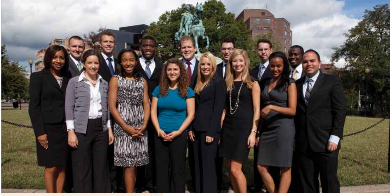
The current Presidential Administrative Fellows on Washington Circle.