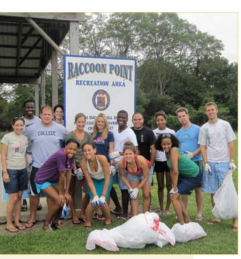
While on their fall retreat, PAFs volunteered to clean up the Raccoon Point beach area in Somerset County, Maryland.

In addition to their numerous individual and small group accomplishments, the Fellows participated in many GW initiatives and community service projects: