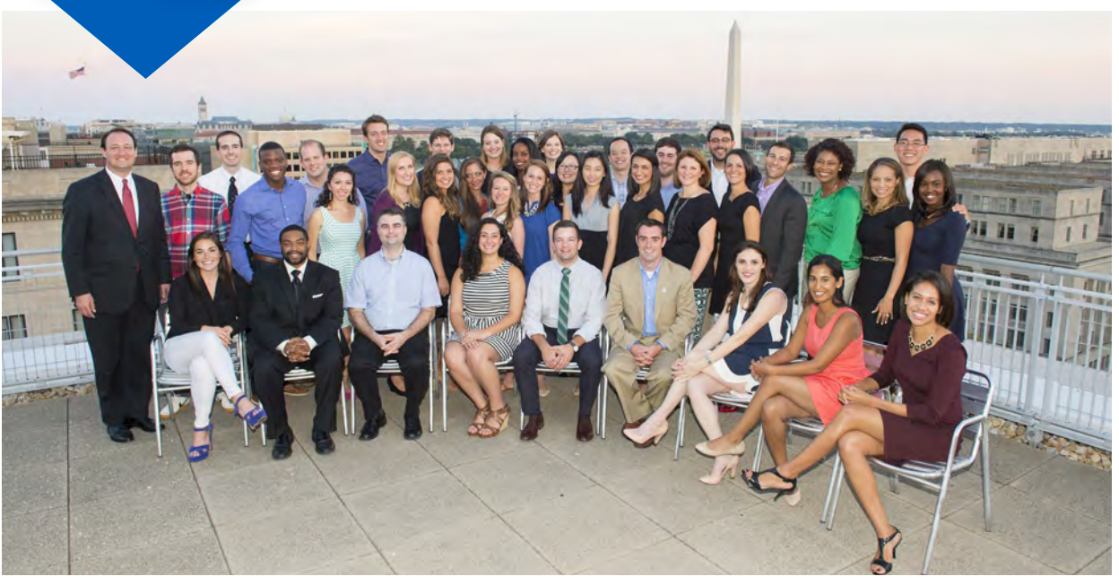
The current PAF cohorts with PAF alumni at the PAF Reception during Alumni Weekend on Saturday, September 20, 2014. This year the PAF program celebrated its 25th anniversary.