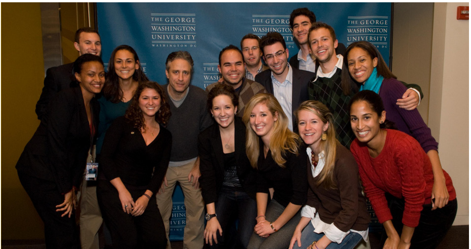
The PAFs took advantage of the opportunity to meet Jon Stewart after his show during Colonials Weekend 2009.